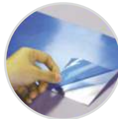
For Steel Sheets & Aluminum