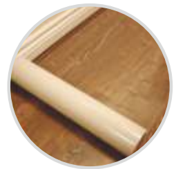
For Furniture & Wood