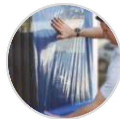
For Glass & Window