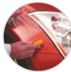
For Finished Surface